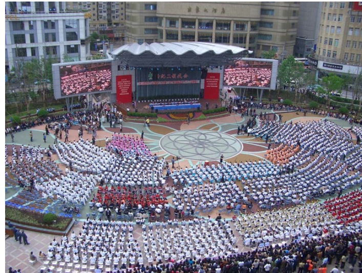
General view of Century Plaza

Century Plaza has a commanding position at the mid point of Nanjing Road pedestrian section