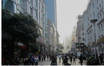
Nanjing Road Pedestrian Street

The organisers of the event, Le Chéile (The Irish Community Association of Shanghai), through the close support of the Irish Consulate of Shanghai, have been granted access to the street by Huangpu District Government for 4 days from Thursday 10th March to Sunday 13th March. One of the major activities, the St Patrick's Parade, will take place on Nanjing Road on Saturday 12th March.