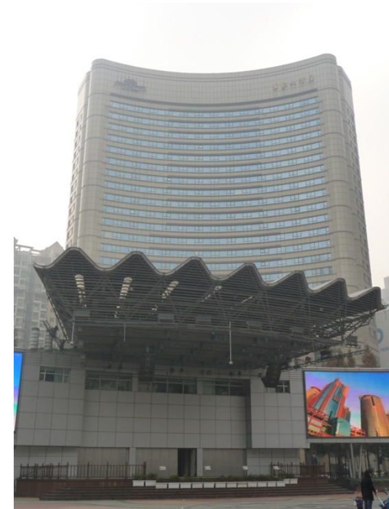
View of Howard Johnson Hotel from Century Plaza