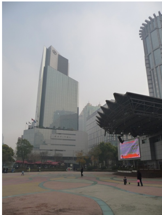
View of Sofitel from Century Plaza